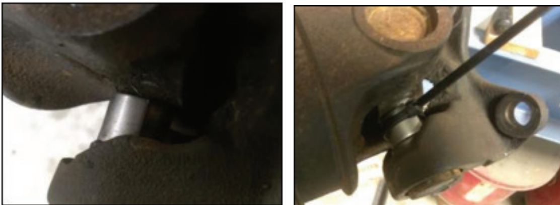
Photos of the sleeve used to press the bearing cap out (with and without zip tie)